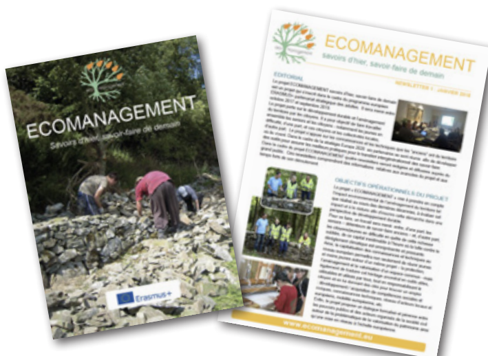
The project web site, the project brochure and the newsletters are produced in the five languages of the project