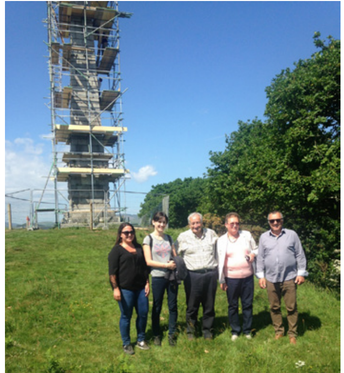
The partners from Corsica and Slovakia visiting the Rutherford monument at Gatehouse which is being restored

Six partners have come together within the project to develop a methodology to establish a formalised and lasting dialogue between the public authorities and local stakeholders, around the theme of the transmission of traditional know-how for sustainable development. This is the second newsletter prepared as part of the Eco-management project and distributed to the general public. Two others will follow, to keep the public informed about the progress of the project and its highlights.